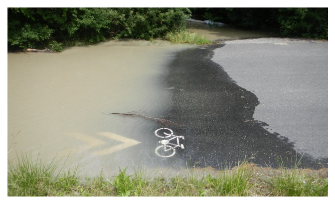
The Danube River — Flood 2013 in Bratislava

In the frame of the national flood mapping in Slovakia, flooding extents for 5 N-years discharges (5, 10, 50, 100, 1000) were calculated using MIKE Powered by DHI's MIKE FLOOD software. Input are based on hydrodynamic modeling of flooding scenarios with different return periods. The results of numerical simulations of flood flows were vital part of flood maps.