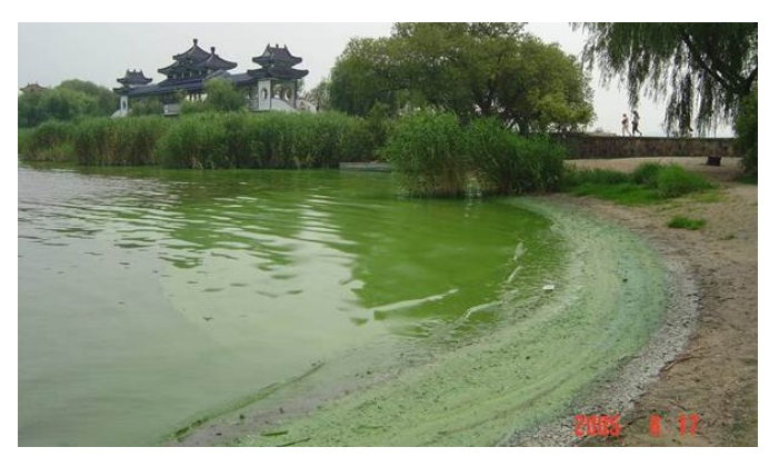
Blue-green algae gathered in Tai Lake at Wuxi, China's Jiangsu Province (11 June 2005).

In light of all these issues, the client turned to us for our vast modelling expertise, our hold on modelling technology and our global knowledge and experience in the same.