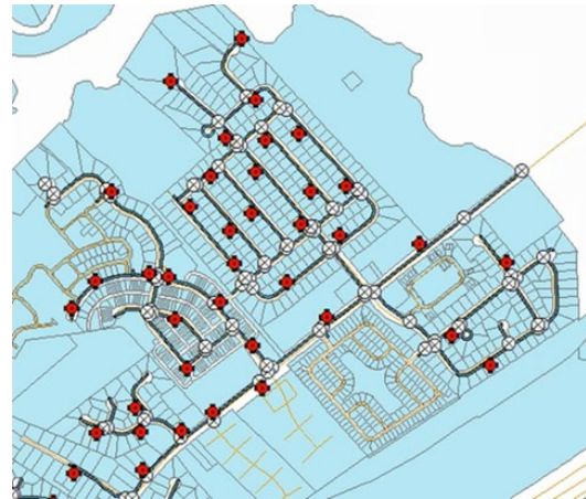
Detailed and accurate hydraulic models of water distribution systems are developed based on GIS, CAD, and SCADA data

The simulations help optimise the quality of water.