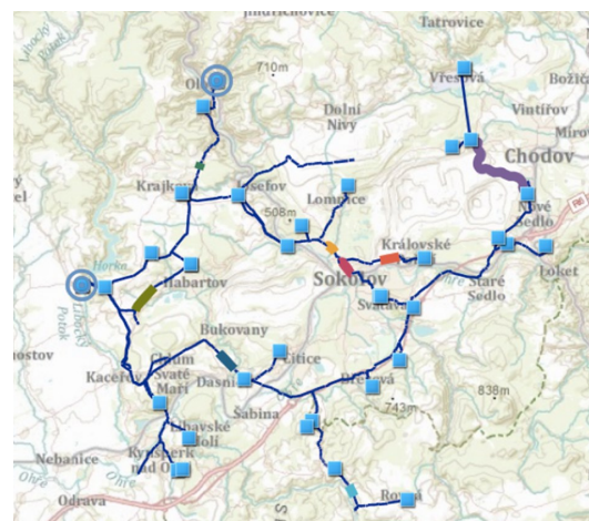
Hydraulic model of a regional water supply system operating in real-time mode

Contact: Petr Ingeduld - pi@dhigroup.com For more information visit: www.dhigroup.com