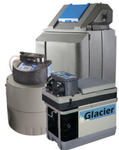
Water sampling devices. These devices come in different sizes and configuration and with optional refrigeration of samples within the device.

If you would like to learn more about safe storage and analysis of your data, please refer to our flyer 'Customised Data Handling Centre'.